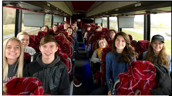
2018 4-H Career Exploration Bus Trip to Ohio State

Each of our neighboring counties are invited to send 8 participants who are interested in learning more about the College and Ohio State, as a whole. We will be taking an Ohio State University Charter Bus and do career exploration activities on the ride to campus. We will have educational videos and lessons for the whole group as we travel. Additionally, the group will do reflection activities and evaluation on the return trip.